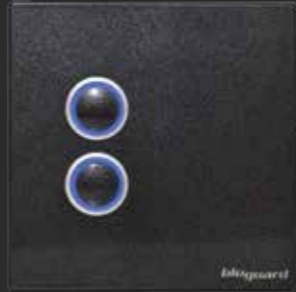
Code : Glossy Black