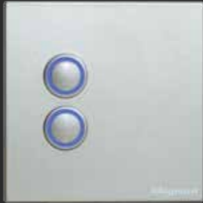
Code : Sparkling Gold