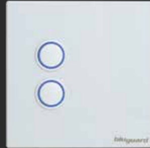
Code : Pearl White